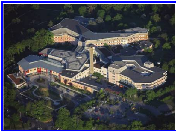
Figure 1 Filderklinik, an anthroposophic hospital in Filderstadt, Germany.