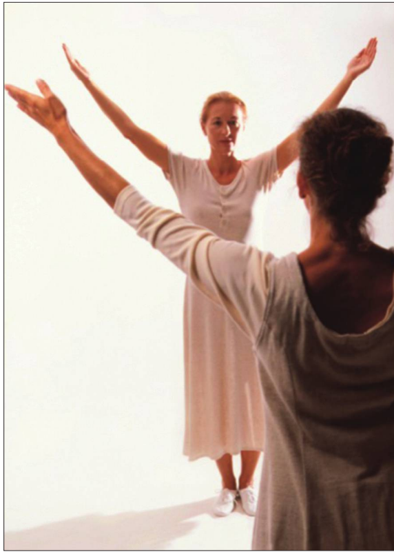
Figure 4 Eurythmy therapy.

of the patient's movement pattern. 27 This selection is based on a core set of principles, prescribing specific movements for specific diseases, constitutional types, and movement patterns. 37,38 A therapy cycle usually consists of 12 to 15 sessions, each usually lasting 30 to 45 minutes; between sessions, patients practice the exercises daily. Qualification as an eurythmy therapist requires 5 and a half years of training according to an international standardized curriculum. Eurythmy therapy is believed to have both general effects (eg, improving breathing patterns and posture, strengthening muscle tone, enhancing physical vitality 39 ) and disease-specific effects. 38