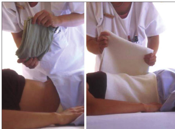
Figure 3 Nursing packs.

External applications—such as embrocation, compresses (Figure 3), hydrotherapy, and medicinal baths—are used as elements of nursing care and therapy to stimulate, strengthen, or regulate hygienic processes. For this purpose, etheric or fatty oils, essences, tinctures, and ointments are used, as well as carbon dioxide in baths. Of particular importance is rhythmical massage (described below).